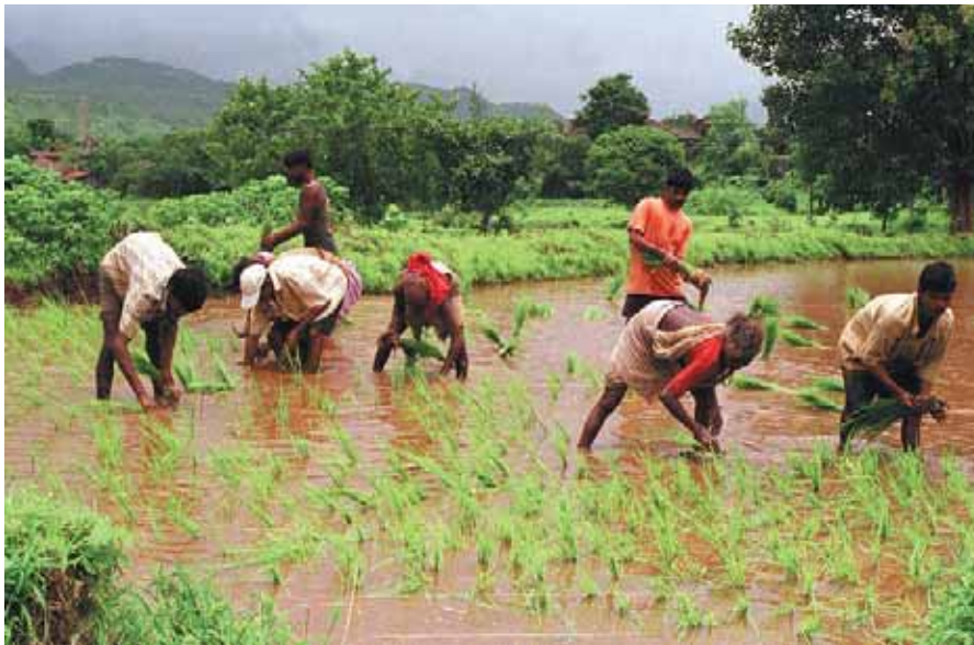
Transplanting paddy is back-breaking work.

The village is surrounded by low hills. Paddy is the main crop that is grown in irrigated lands. Most of the families earn a living through agriculture.