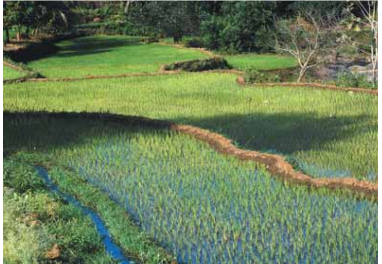
Transplanted paddy growing in a few of Ramalingam's 20 acres. A result of hard labour performed by agricultural workers like Thulasi.

This is when we can say they are caught in debt. In recent years this has become a major cause of distress among farmers. In some areas this has also resulted in many farmers committing suicide.