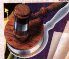
repudiate the same," said the president of north district

While rejecting the girl's insurance claim, the company alleged her ailment was not disclosed at the time of taking the policy.