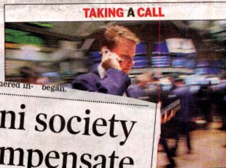
TAKING A CALL

Now those tele-service providers who the unnerving SMS will land in jail to check the menace. On July 13, 2006, had ordered in- began.