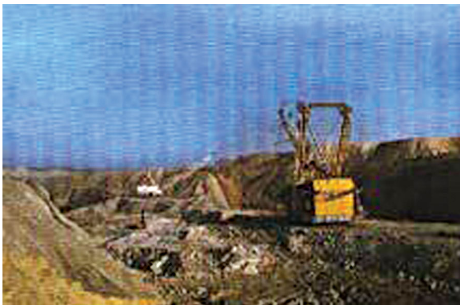
Fig. 5.2: A coal mine

When heated in air, coal burns and produces mainly carbon dioxide gas.