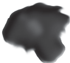
Fig. 5.3: Coal-tar

It is a black, thick liquid (Fig. 5.3) with unpleasant smell. It is a mixture of