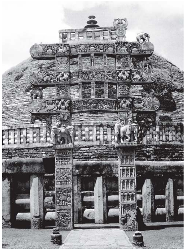
Top : The Great Stupa at Sanchi, Madhya Pradesh. Stupas like this one were built over several centuries. While the brick mound probably dates to the time of Ashoka (Chapter 8), the railings and gateways were added during the time of later rulers.

Often, as at Bhitargaon, a tower, known as the shikhara , was built on top of the