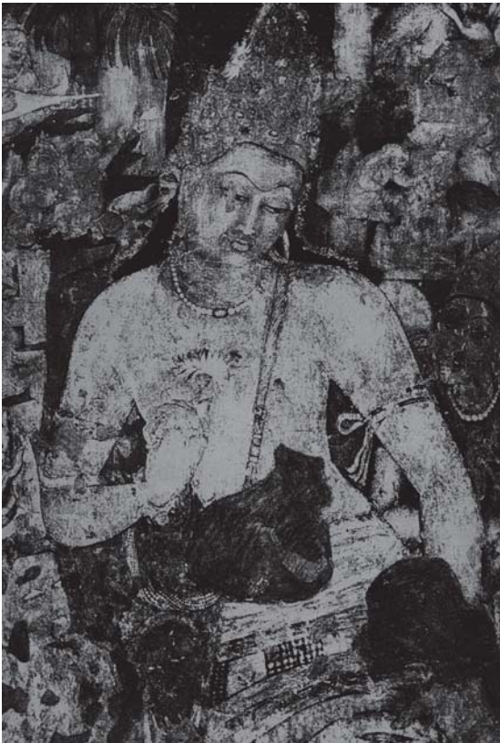
Paintings from Ajanta. Describe what you see in each of these paintings.

women who are known only by their names which were inscribed on pillars, railings and walls. So when you get a chance to visit any of these buildings, remember how several hundreds of people probably worked to construct and decorate them.