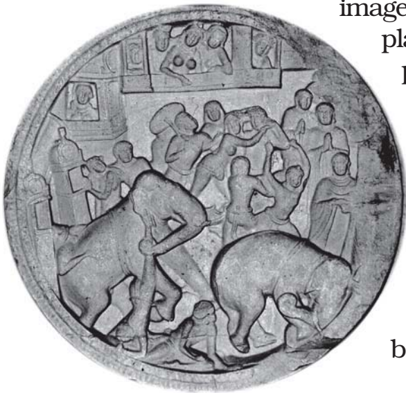
Left : Sculpture from Amaravati. Look at the picture and describe what you see.