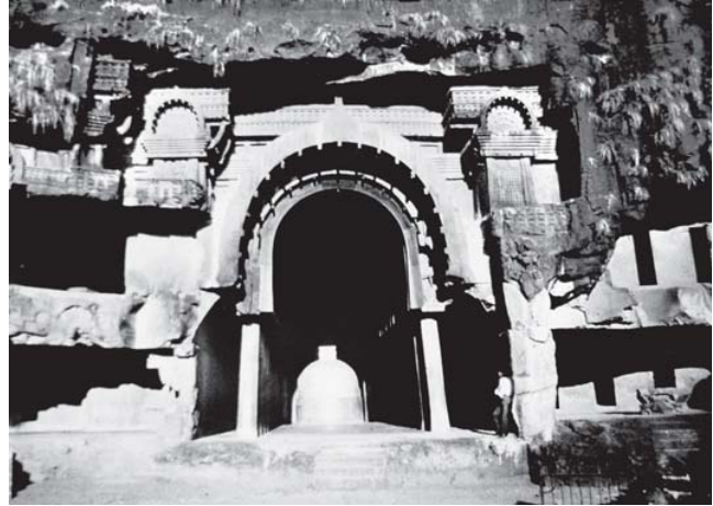
A cave at Karle, Maharashtra

Read page 100 once more. Can you think of how Buddhism spread to these lands?