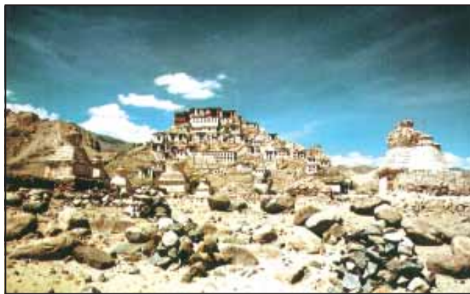
Fig. 10.5 Thiksey Monastery

The finest cricket bats are made from the wood of the willow trees.