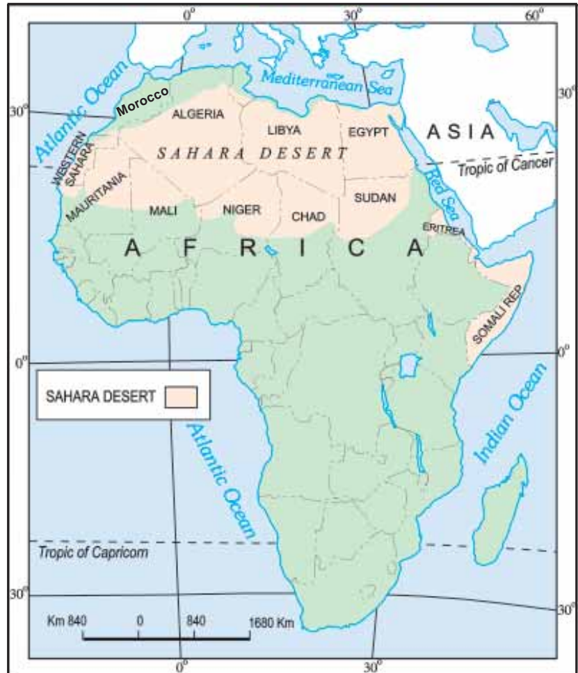
Fig. 10.2: Sahara in Africa

You will be surprised to know that present day Sahara once used to be a lush green plain. Cave paintings in Sahara desert show that there used to be rivers with crocodiles. Elephants, lions, giraffes, ostriches, sheep, cattle and goats were common animals. But the change in climate has changed it to a very hot and dry region.