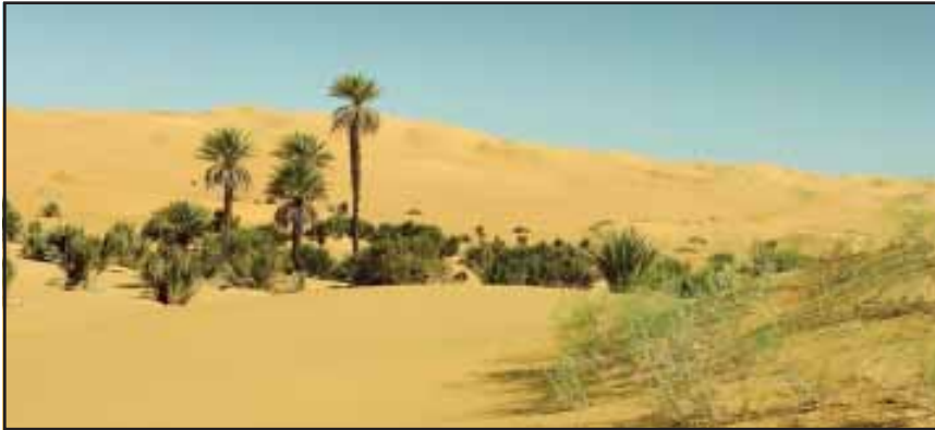
Fig. 10.3: Oasis in the Sahara Desert

snakes and lizards are the prominent animal species living there.