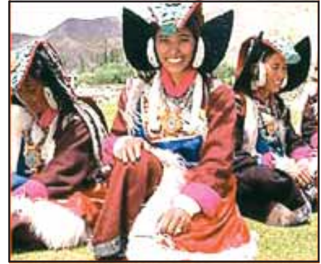
Fig. 10.6. Ladakhi Women in Traditional Dress

Life of people is undergoing change due to modernisation. But the people of Ladakh have over the centuries learned to live in balance and harmony with nature. Due to scarcity of resources like water and fuel, they are used with reverence and care. Nothing is discarded or wasted.