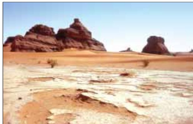
Fig. 10.1: The Sahara Desert

Desert: It is an arid region characterised by extremely high or low temperatures and has scarce vegetation.