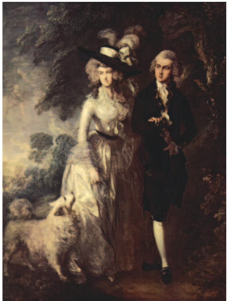
Fig. 1 – An upper-class couple in eighteenth-century England. Painting by the English artist Thomas Gainsborough (1727-1788)

The French Revolution ended these distinctions. As you know from Chapter I, members of the Jacobin clubs even called themselves the ‘sans culottes’ to distinguish themselves from the aristocracy who wore the fashionable ‘knee breeches’. Sans culottes literally meant those ‘without knee breeches’. From now on, both men and women began wearing clothing that was loose and comfortable. The colours of France – blue, white and red – became popular as they were a sign of the patriotic citizen. Other political symbols too became a part of dress: the red cap of liberty, long trousers and the revolutionary cockade pinned on to a hat. The simplicity of clothing was meant to express the idea of equality.