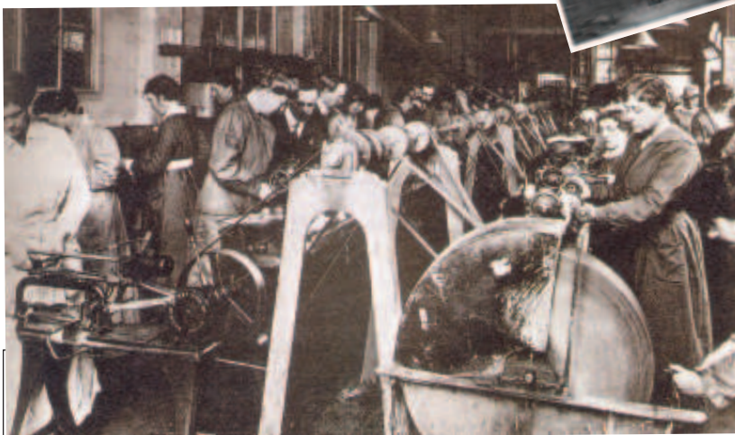
Fig.9b – Women working at a British ammunition factory during the First World War. At this time thousands of women came out to work as war production created a demand for increased labour. The need for easy movement changed clothing styles.

Fig.9a – Even for middle- and upper-class women, clothing styles changed. Skirts became shorter and frills were done away with.