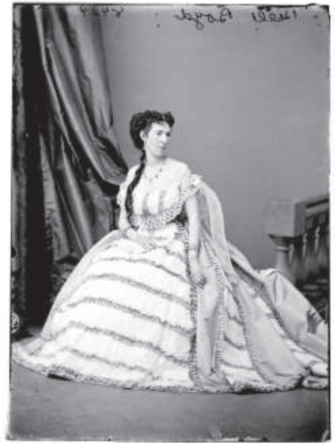
Fig.8 – A woman in nineteenth-century USA, before the dress reforms. Notice the flowing gown sweeping the ground. Reformers reacted to this type of clothing for women.

By the end of the nineteenth century, however, change was clearly in the air. Ideals of beauty and styles of clothing were both transformed under a variety of pressures. People began accepting the ideas of reformers they had earlier ridiculed. With new times came new values.