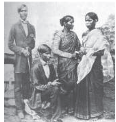
Fig. 11 – Converts to Christianity in Goa in 1907, who have adopted Western dress.