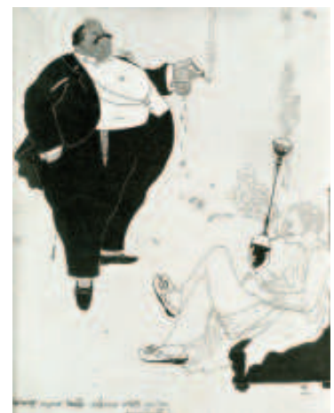
Fig. 12 – Cartoon, 'The Modern Patriot', by Gaganendranath Tagore, early twentieth century. A sarcastic picture of a foolish man who copies western dress but claims to love his motherland with all his heart. The pot-bellied man with cigarette and Western clothes was ridiculed in many cartoons of the time.