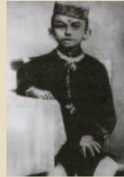
Fig. 21 – Mahatma Gandhi in his earliest known picture, aged 7.

On his return to India in 1915, he decided to dress like a Kathiawadi peasant. Only in 1921 did he adopt the short dhoti, the form of dress he wore until his death. On 22 September 1921, a year after launching the non-cooperation movement, which sought swaraj in one year, he announced: