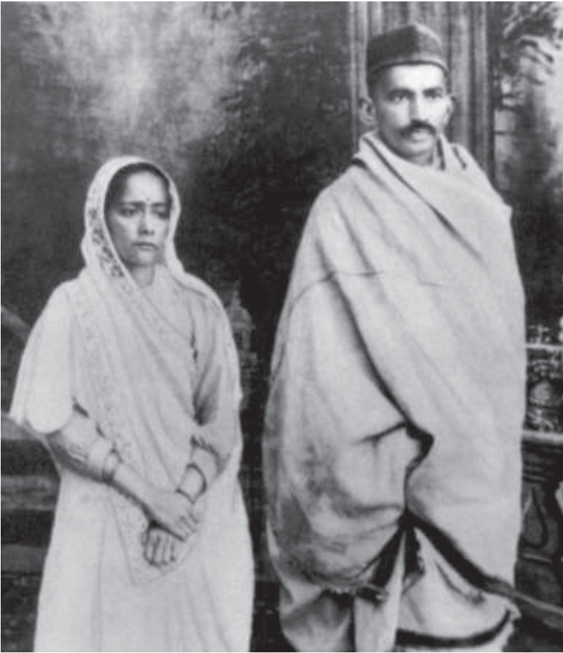
Fig.26 – Mahatma Gandhi with Kasturba, shortly after his return from South Africa. Dressed simply, he later confessed to feeling awkward amongst the Westernised Bombay elite. He said that he was more at home among the labourers in South Africa.

‘I propose to discard at least up to 31st of October my topi and vest and to content myself with a loincloth, and a chaddar whenever necessary for protection of my body. I adopt the change because I have always hesitated to advise anything I may not be prepared to follow ...’