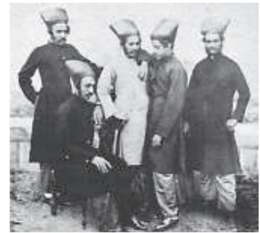
Fig. 10 – Parsis in Bombay, 1863.