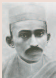
Fig.28 – 1915. In an embroidered Kashmiri cap.