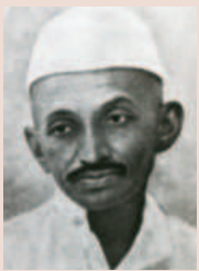
Fig.29 – 1920. Wearing the Gandhi cap.