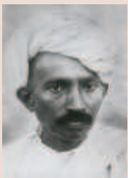
Fig.27 – 1915. Mahatma Gandhi with a turban.

Large numbers of nationalists defiantly wore the Gandhi cap and were even beaten or arrested for doing so. With the rise of the Khilafat movement in the post-First World War years, the fez, a tasseled Turkish cap, became a sign of anti-colonialism in India. Though many Hindus – as in Hyderabad for instance – also wore the fez, it soon became identified solely with Muslims.