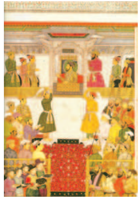
Fig. 14 – Europeans bringing gifts to Shah Jehan, Agra, 1633, from the Padshahnama. Notice the European visitors’ hats at the bottom of the picture, creating a contrast with the turbans of the courtiers.

Today, the Mysore turban is used largely on ceremonial occasions and to honour visiting dignitaries.