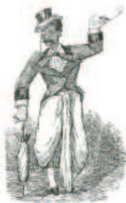
Fig. 13 – Cartoon from Indian Charivari, 1873.

Three. Some men resolved this dilemma by wearing Western clothes without giving up their Indian ones. Many Bengali bureaucrats in the late nineteenth century began stocking western-style clothes for work outside the home and changed into more comfortable Indian clothes at home. Early-twentieth-century anthropologist Verrier Elwin remembered that policemen in Poona who were going off duty would take their