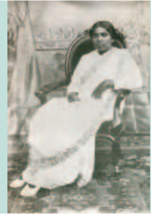
Fig. 19 – Maharani of Travancore (1930). Note the Western shoes and the modest long-sleeved blouse. This style had become common among the upper classes by the early twentieth century.