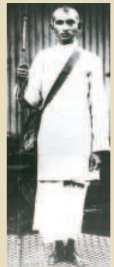
Fig. 25 – In 1913 in South Africa, dressed for Satyagraha