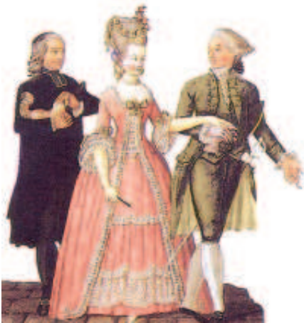
Fig.2 – An aristocratic couple on the eve of the French Revolution. Notice the sumptuous clothing, the elaborate headgear, and the lace edgings on the dress the lady is wearing. She also has a corset inside the dress. This was meant to confine and shape her waist so that she appeared narrow waisted. The nobleman, as was the custom of the time, is wearing a long soldier's coat, knee breeches, silk stockings and high heeled shoes. Both of them have elaborate wigs and both have their faces painted a delicate shade of pink, for the display of natural skin was considered uncultured.