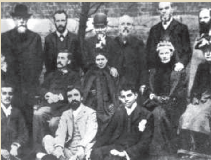
Fig. 23 – Mahatma Gandhi (seated front right) London, 1890, at the age of 21. Note the typical Western three-piece suit.