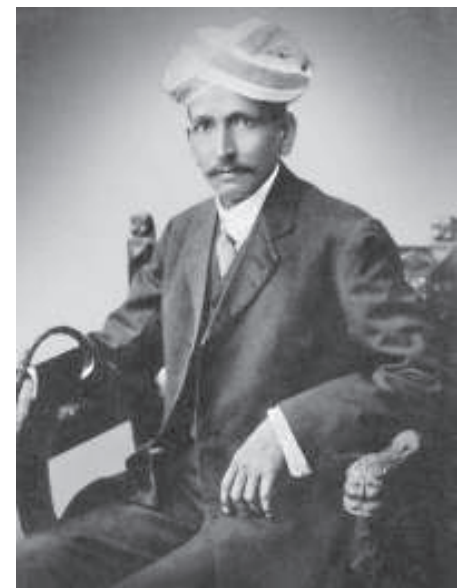
Fig. 15 – Sir M. Visveswaraya. A leading engineer-technocrat and the Dewan of Mysore state from 1912 to 1918. He wore a turban with his three-piece Western style suit.