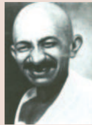
Fig.30 – 1921. After shaving his head.