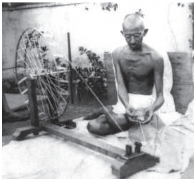
Fig.20 – The familiar image of Mahatma Gandhi, bare chested and at his spinning wheel.

If you were a poor peasant would you have willingly taken to giving up mill-made cloth?