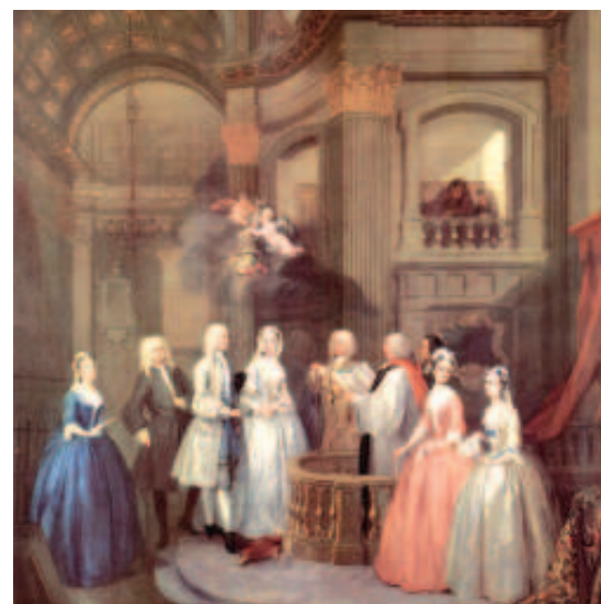
Fig.6 – Scene at an upper-class wedding by the English painter William Hogarth (1697-1764)

But not everyone accepted these values. Over the nineteenth century, ideas changed. By the 1830s, women in England began agitating for democratic rights. As the suffrage movement developed, many began campaigning for dress reform. Women's magazines described how tight dresses and corsets caused deformities and illness among young