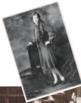
Fig.9 – Changes in clothing in the early twentieth century.

In the late 1870s, heavy, restrictive underclothes, which had created such a storm in the pages of women's magazines, were gradually discarded. Clothes got lighter, shorter and simpler.