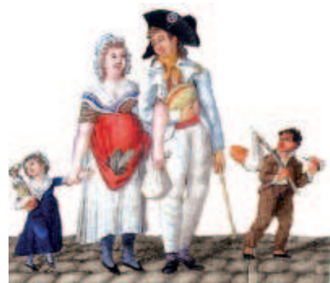
Fig.5 – A sans-culottes family, 1793.