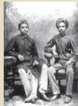
Fig. 22 – Mahatma Gandhi at age 14, with a friend.