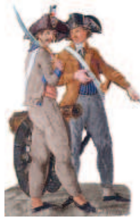
Fig.4 – Volunteers during the French Revolution.