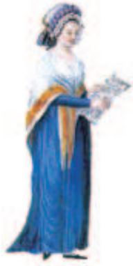
Fig.3 – Woman of the middle classes, 1791.