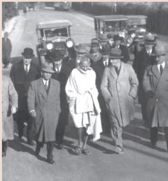
Fig.31 – On his visit to Europe in 1931. By now his clothes had become a powerful political statement against Western cultural domination.