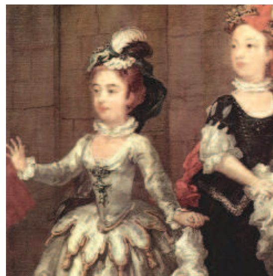
Fig.7 – A child in an aristocratic household by the English painter William Hogarth (1697-1764). Notice the tiny waist even at this age, probably held in by a corset, and the sweeping gown which would restrict her movement.