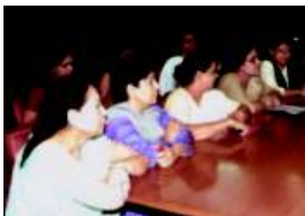
The above photo shows a few women Members of Parliament.

Why do you think there are so few women in Parliament? Discuss.