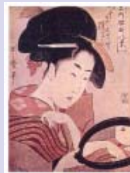
Fig. 3 – An ukiyo print by Kitagawa Utamaro.

Kitagawa Utamaro , born in Edo in 1753, was widely known for his contributions to an art form called ukiyo ('pictures of the floating world') or depiction of ordinary human experiences, especially urban ones. These prints travelled to contemporary US and Europe and influenced artists like Manet, Monet and Van Gogh. Publishers like Tsutaya Juzaburo identified subjects and commissioned artists who drew the theme in outline. Then a skilled woodblock carver pasted the drawing on a woodblock and carved a printing block to reproduce the painter's lines. In the process, the original drawing would be destroyed and only prints would survive.