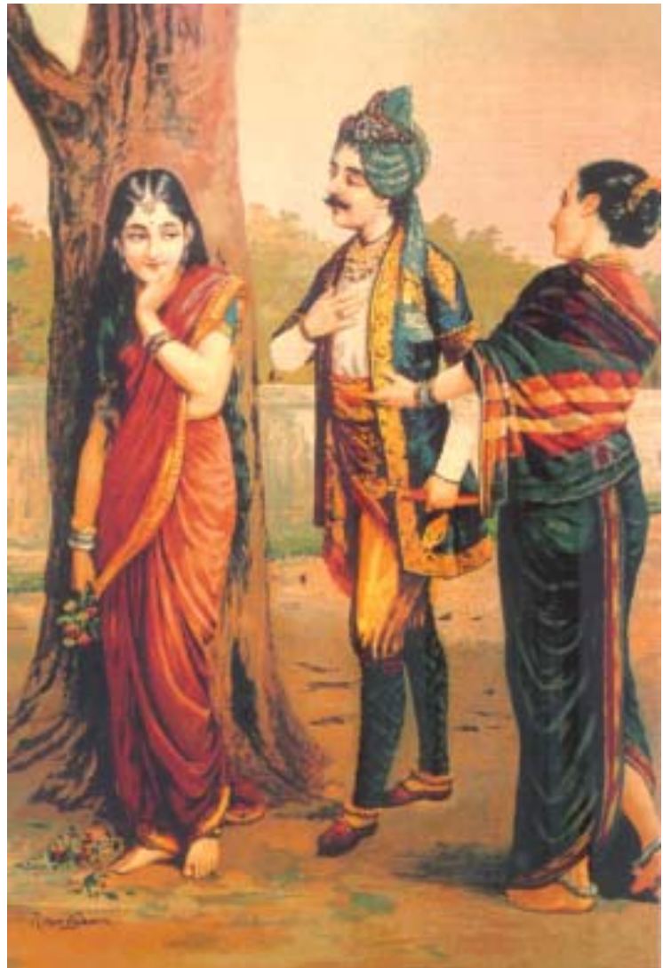
Fig. 17 – Raja Ritudhwaj rescuing Princess Madalsa from the captivity of demons, print by Ravi Varma. Raja Ravi Varma produced innumerable mythological paintings that were printed at the Ravi Varma Press.

By the 1870s, caricatures and cartoons were being published in journals and newspapers, commenting on social and political issues. Some caricatures ridiculed the educated Indians' fascination with Western tastes and clothes, while others expressed the fear of social change. There were imperial caricatures lampooning nationalists, as well as nationalist cartoons criticising imperial rule.