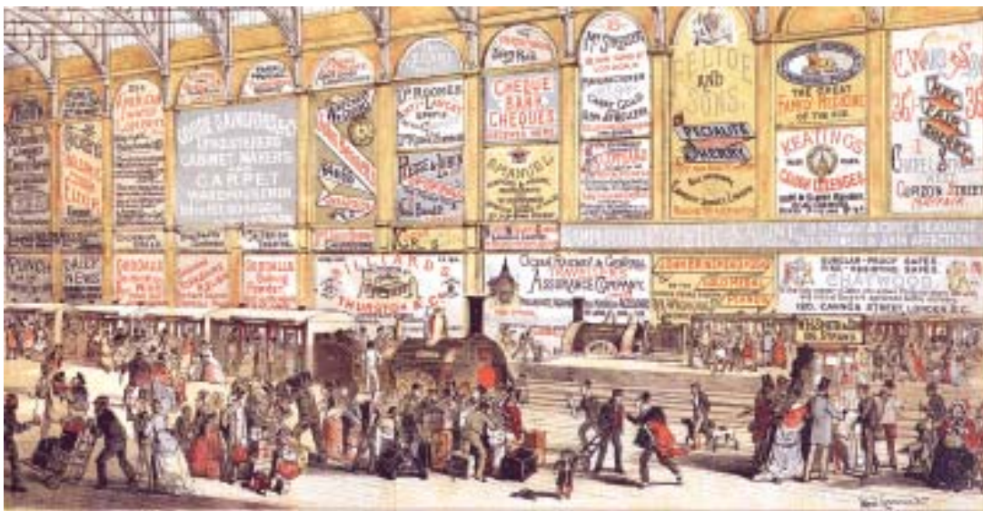
Fig. 13 – Advertisements at a railway station in England, a lithograph by Alfred Concanen, 1874. Printed advertisements and notices were plastered on street walls, railway platforms and public buildings.

Look at Fig. 13. What impact do such advertisements have on the public mind? Do you think everyone reacts to printed material in the same way?