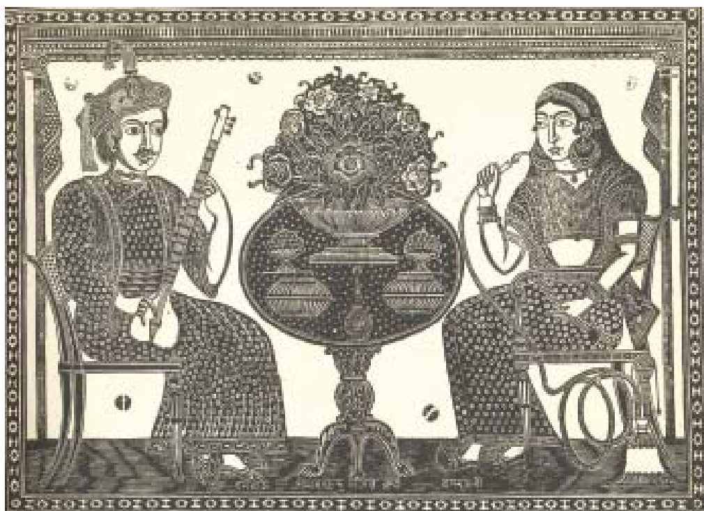
Fig. 20 – An Indian couple, black and white woodcut. The image shows the artist's fear that the cultural impact of the West has turned the family upside down. Notice that the man is playing the veena while the woman is smoking a hookah. The move towards women's education in the late nineteenth century created anxiety about the breakdown of traditional family roles.