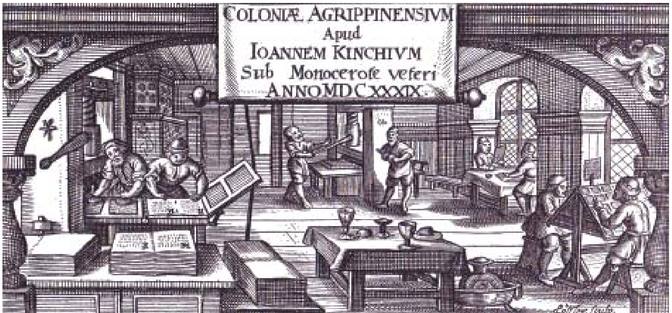
Fig. 8 – A printer’s workshop, sixteenth century. This picture depicts what a printer’s shop looked like in the sixteenth century. All the activities are going on under one roof. In the foreground on the right, compositors are at work, while on the left galleys are being prepared and ink is being applied on the metal types; in the background, the printers are turning the screws of the press, and near them proofreaders are at work. Right in front is the final product – the double-page printed sheets, stacked in neat piles, waiting to be bound.

New words Compositor – The person who composes the text for printing Galley – Metal frame in which types are laid and the text composed