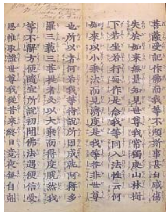
Fig. 2 – A page from the Diamond Sutra.

Calligraphy – The art of beautiful and stylised writing