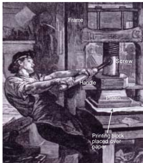
Fig. 6 – Gutenberg Printing Press. Notice the long handle attached to the screw. This handle was used to turn the screw and press down the platen over the printing block that was placed on top of a sheet of damp paper. Gutenberg developed metal types for each of the 26 characters of the Roman alphabet and devised a way of moving them around so as to compose different words of the text. This came to be known as the moveable type printing machine, and it remained the basic print technology over the next 300 years. Books could now be produced much faster than was possible when each print block was prepared by carving a piece of wood by hand. The Gutenberg press could print 250 sheets on one side per hour.