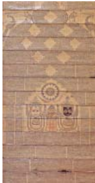
Fig. 14 – Pages from the Gita Govinda of Jayadeva, eighteenth century. This is a palm-leaf handwritten manuscript in accordion format.

Manuscripts, however, were highly expensive and fragile. They had to be handled carefully, and they could not be read easily as the