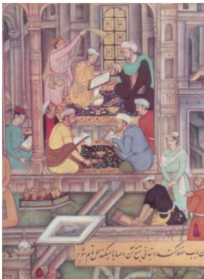
Fig. 1 – Book making before the age of print, from Akhlaq-i-Nasiri, 1595.

In this chapter we will look at the development of print, from its beginnings in East Asia to its expansion in Europe and in India. We will understand the impact of the spread of technology and consider how social lives and cultures changed with the coming of print.