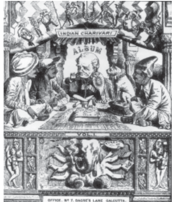
Fig. 18 – The cover page of Indian Charivari.

While Urdu, Tamil, Bengali and Marathi print culture had developed early, Hindi printing began seriously only from the 1870s. Soon, a large segment of it was devoted to the education of women. In