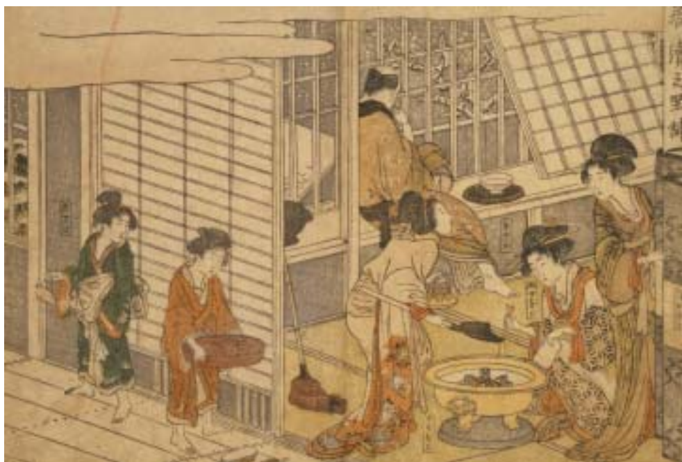
Fig. 4 – A morning scene, ukiyo print by Shunman Kubo, late eighteenth century. A man looks out of the window at the snowfall while women prepare tea and perform other domestic duties.