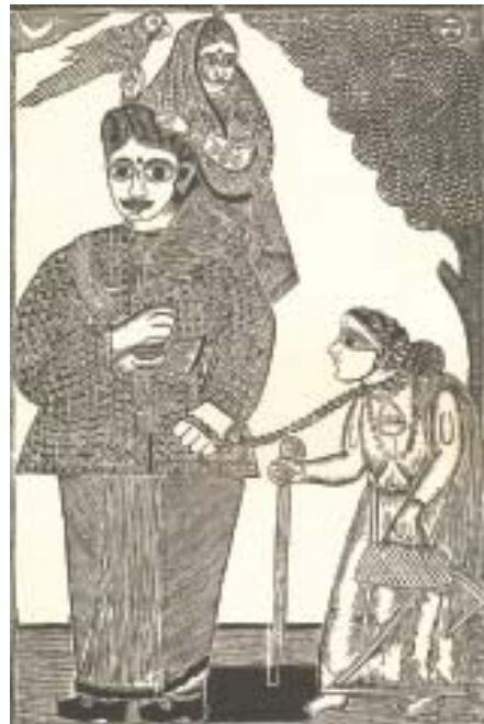
Fig. 19 – Ghor Kali (The End of the World), coloured woodcut, late nineteenth century. The artist's vision of the destruction of proper family relations. Here the husband is totally dominated by his wife who is perched on his shoulder. He is cruel towards his mother, dragging her like an animal, by the noose.

In Bengal, an entire area in central Calcutta – the Battala – was devoted to the printing of popular books. Here you could buy cheap editions of religious tracts and scriptures, as well as literature that was considered obscene and scandalous. By the late nineteenth century, a lot of these books were being profusely illustrated with woodcuts and coloured lithographs. Pedlars took the Battala publications to homes, enabling women to read them in their leisure time.