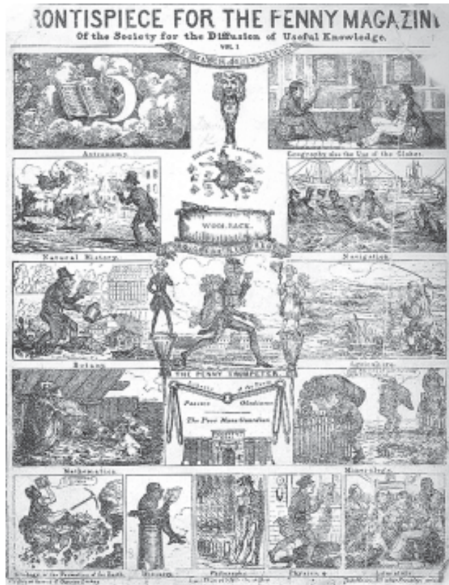
Fig. 12 – Frontispiece of Penny Magazine. Penny Magazine was published between 1832 and 1835 in England by the Society for the Diffusion of Useful Knowledge. It was aimed primarily at the working class.

Lending libraries had been in existence from the seventeenth century onwards. In the nineteenth century, lending libraries in England became instruments for educating white-collar workers, artisans and lower-middle-class people. Sometimes, self-educated working class people wrote for themselves. After the working day was gradually shortened from the mid-nineteenth century, workers had some time for self-improvement and self-expression. They wrote political tracts and autobiographies in large numbers.