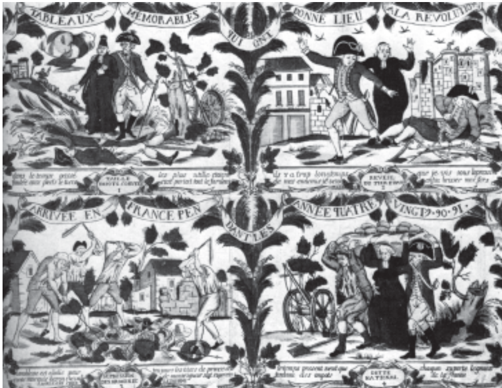
Fig. 11 – The nobility and the common people before the French Revolution, a cartoon of the late eighteenth century.

Imagine that you are a cartoonist in France before the revolution. Design a cartoon as it would have appeared in a pamphlet.