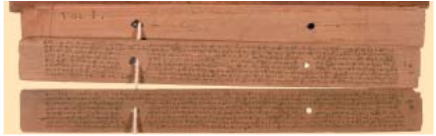
Fig. 16 – Pages from the Rigveda.

script was written in different styles. So manuscripts were not widely used in everyday life. Even though pre-colonial Bengal had developed an extensive network of village primary schools, students very often did not read texts. They only learnt to write. Teachers dictated portions of texts from memory and students wrote them down. Many thus became literate without ever actually reading any kinds of texts.