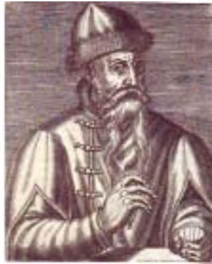
Fig. 5 – A Portrait of Johann Gutenberg, 1584.

This shift from hand printing to mechanical printing led to the print revolution.