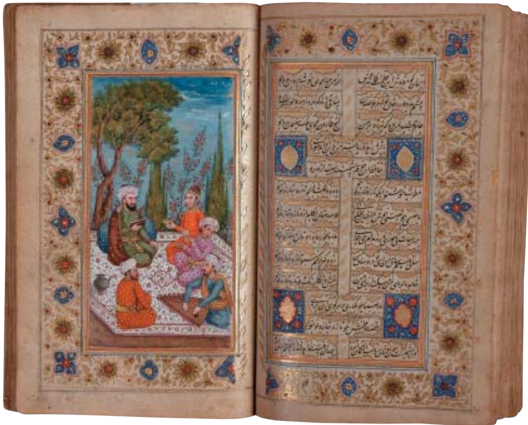
Fig. 15 – Pages from the Diwan of Hafiz, 1824.

Hafiz was a fourteenth-century poet whose collected works are known as Diwan. Notice the beautiful calligraphy and the elaborate illustration and design. Manuscripts like this continued to be produced for the rich even after the coming of the letterpress.