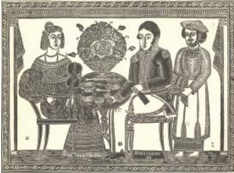
Fig. 21 – A European couple sitting on chairs, nineteenth-century woodcut.

The picture suggests traditional family roles. The Sahib holds a liquor bottle in his hand while the Memsahib plays the violin.