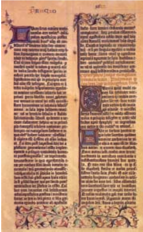
Fig. 7 – Pages of Gutenberg’s Bible, the first printed book in Europe. Gutenberg printed about 180 copies, of which no more than 50 have survived. Look at these pages of Gutenberg’s Bible carefully. They were not just products of new technology. The text was printed in the new Gutenberg press with metal type, but the borders were carefully designed, painted and illuminated by hand by artists. No two copies were the same. Every page of each copy was different. Even when two copies look similar, a careful comparison will reveal differences. Elites everywhere preferred this lack of uniformity: what they possessed then could be claimed as unique, for no one else owned a copy that was exactly the same. In the text you will notice the use of colour within the letters in various places. This had two functions: it added colour to the page, and highlighted all the holy words to emphasise their significance. But the colour on every page of the text was added by hand. Gutenberg printed the text in black, leaving spaces where the colour could be filled in later.