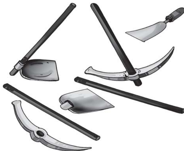
Fig. 6.6 Tools are often heated before fixing wooden handles

The iron blade of these tools has a ring in which the wooden handle is fixed. Normally, the ring is slightly smaller in size than the wooden handle. To fix the handle, the ring is heated and it becomes slightly larger in size ( expands ). Now, the handle easily fits into the ring. When the ring cools down it contracts and fits tightly on to the handle.