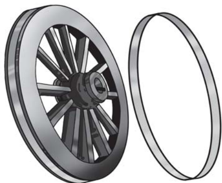
Fig. 6.7 Cart wheel with metal rim fixed to it

When we heat water in a pan, it begins to boil after some time. If we continue to heat further, the quantity of water in the pan begins to decrease.