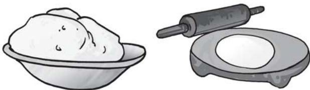
Fig 6.3 A ball of dough and a rolled out roti

Take some dough and make a ball. Try to roll out a roti (Fig. 6.3). May be you are not happy with its shape and wish to change it back into a ball of dough again.