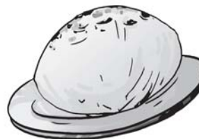
Fig 6.5 A roti

Roll out a roti from the ball of dough again and bake it on a tawa (Fig.6.5).