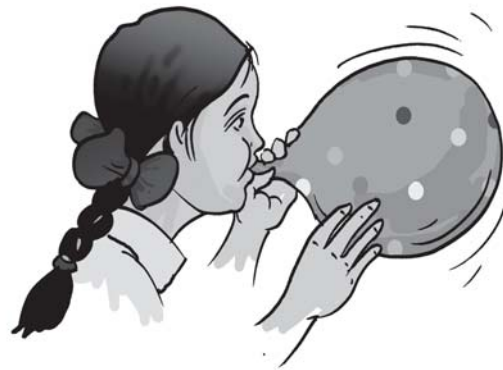
Fig 6.1 A balloon changes its size and shape on blowing air into it

Take a balloon and blow it. Take care that it does not burst. The shape and size of the balloon have changed (Fig. 6.1). Now, let the air escape the balloon.