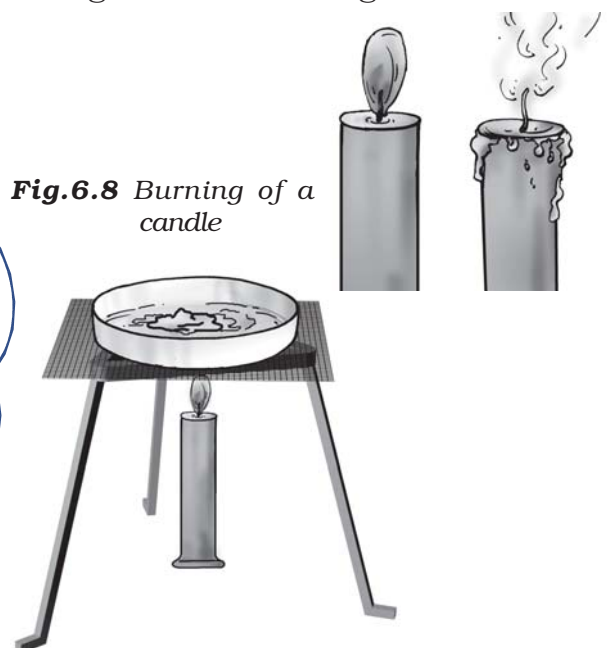
Fig.6.8 Burning of a candle

Can the change in the length of the candle be reversed? If we were to take some wax in a pan and heat it, can this change be reversed (Fig. 6.9)?