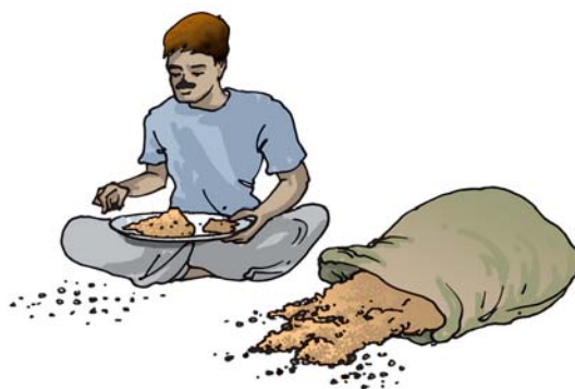
Fig. 5.3 Handpicking stones from grain

This method of handpicking can be used for separating slightly larger sized impurities like the pieces of dirt, stone, and husk from wheat, rice or pulses (Fig. 5.3). The quantity of such impurities is usually not very large. In such situations, we find that handpicking is a convenient method of separating substances.