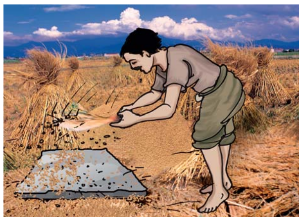
Fig. 5.4 Threshing

The process that is used to separate grain from stalks etc. is threshing . In this process, the stalks are beaten to free the grain seeds (Fig. 5.4). Sometimes,