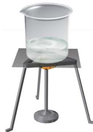
Fig. 5.11 Heating a beaker containing salt water and disappear completely? Now, add two spoons of salt to water in another beaker and stir it well. Do you see any change in the colour of water? Can you see any salt in the beaker, after stirring? Heat the beaker containing the salt water (Fig. 5.11). Let the water boil away. What is left in the beaker?

Heat a beaker containing some water. Allow the water to boil. If you continue heating, would the water turn into steam