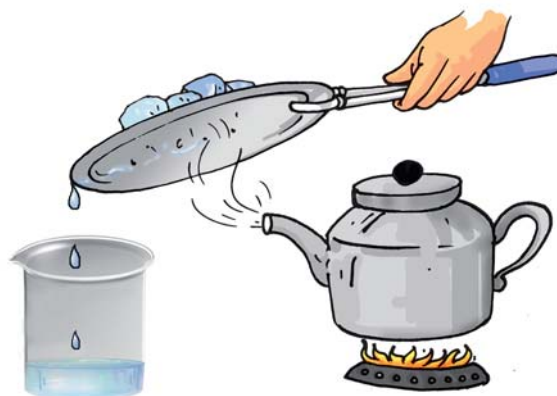
Fig. 5.13 Evaporation and condensation

Paheli faced a problem while recovering salt mixed with sand. She has mixed a packet of salt in a small