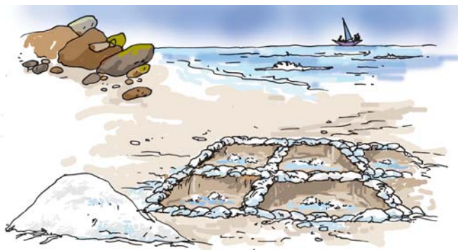
Fig. 5.12 Obtaining salt from sea water