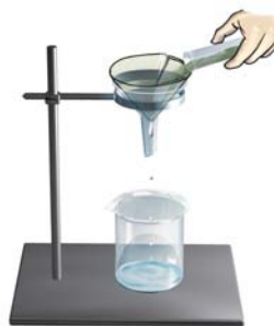
Fig. 5.10 Filtration using a filter paper

Fruit and vegetable juices are usually filtered before drinking to separate the seeds and solid particles of pulp. The method of filtration is also used in the process of preparing cottage cheese ( paneer ) in our homes. You might have seen that for making paneer , a few drops of lemon juice are added to milk as it boils. This gives a mixture of particles of solid paneer and a liquid. The paneer is then separated by filtering the mixture through a fine cloth or a strainer.