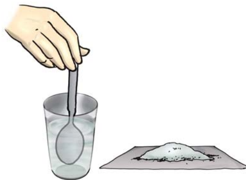
Fig 5.14 Dissolving salt in water

Here is a hint as to what might have gone wrong when Paheli tried to recover large quantity of salt mixed with sand. Perhaps the quantity of salt was much more than that required to form a saturated solution. The undissolved salt