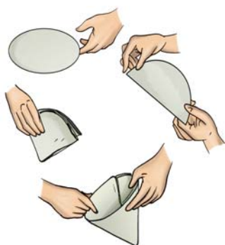
Fig. 5.9 Folding a filter paper to make a cone

smaller pores. A filter paper is one such filter that has very fine pores in it. Fig. 5.9 shows the steps involved in using a filter paper. A filter paper folded in the form of a cone is fixed onto a funnel (Fig. 5.10). The mixture is then poured on the filter paper. Solid particles in the mixture do not pass through it and remain on the filter.