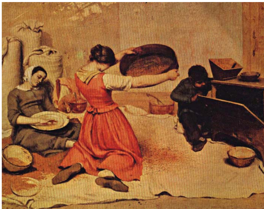
“The winnowers”, painted by Gustav Courbet in 1853