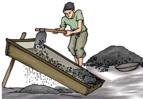
Fig. 5.7 Pebbles and stones are removed from sand by sieving

You may have also noticed similar sieves being used at construction sites