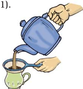
Fig. 5.1 Separating tea leaves with a strainer

Tea leaves are separated from the liquid with a strainer, while preparing tea (Fig. 5.1).