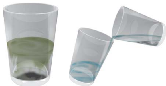
Fig. 5.8 Separating two components of a mixture by sedimentation and decantation

Let us again consider a mixture of a solid and liquid. After preparing tea, what do you do to remove the tea leaves? Try decantation. It helps a little. But, do you still get a few leaves in your tea? Now, pour the tea through a strainer.