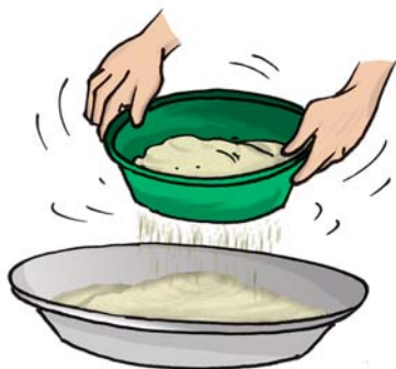
Fig. 5.6 Sieving

In a flour mill, impurities like husk and stones are removed from wheat before grinding it. Usually, a bagful of wheat is poured on a slanting sieve. The sieving removes pieces of stones, stalk and husk that may still remain with wheat after threshing and winnowing.