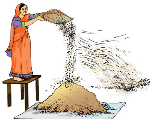
Fig. 5.5 Winnowing

This method of separating components of a mixture is called winnowing . Winnowing is used to separate heavier and lighter components of a mixture by wind or by blowing air.