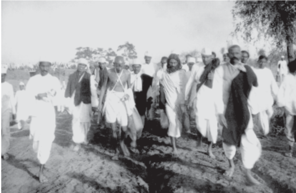
Fig. 7 – The Dandi march. During the salt march Mahatma Gandhi was accompanied by 78 volunteers. On the way they were joined by thousands.

with the British, as they had done in 1921-22, but also to break colonial laws. Thousands in different parts of the country broke the salt law, manufactured salt and demonstrated in front of government salt factories. As the movement spread, foreign cloth was boycotted, and liquor shops were picketed. Peasants refused to pay revenue and chaukidari taxes, village officials resigned, and in many places forest people violated forest laws – going into Reserved Forests to collect wood and graze cattle.