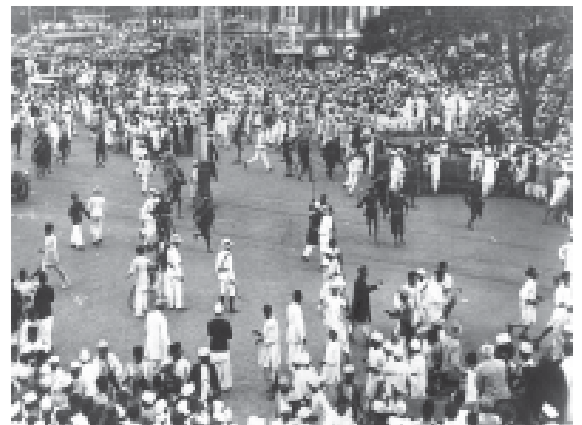
Fig. 8 – Police cracked down on satyagrahis, 1930.

In such a situation, Mahatma Gandhi once again decided to call off the movement and entered into a pact with Irwin on 5 March 1931. By this Gandhi-Irwin Pact, Gandhiji consented to participate in a Round Table Conference (the Congress had boycotted the first