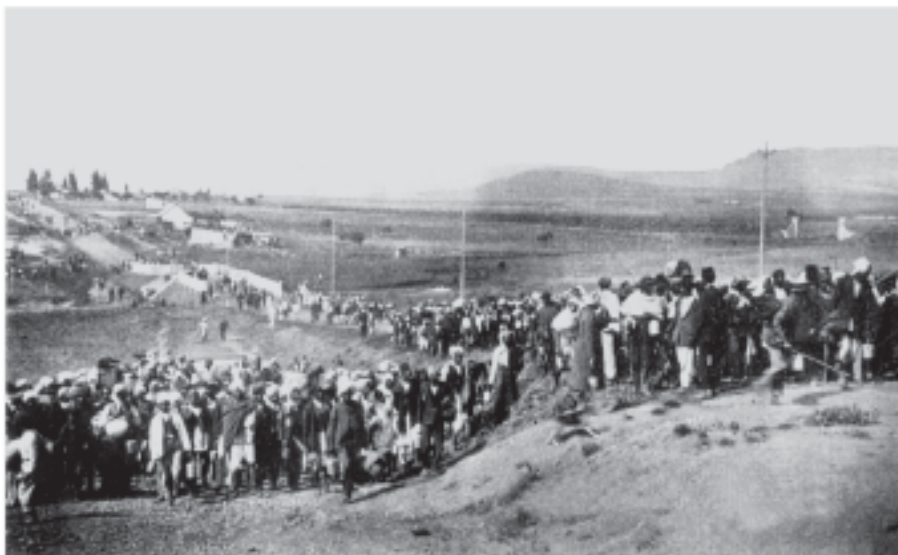
Fig. 2 – Indian workers in South Africa march through Volksrust, 6 November 1913. Mahatma Gandhi was leading the workers from Newcastle to Transvaal. When the marchers were stopped and Gandhiji arrested, thousands of more workers joined the satyagraha against racist laws that denied rights to non-whites.

Forced recruitment – A process by which the colonial state forced people to join the army