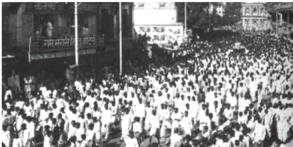
Fig. 1 – 6 April 1919. Mass processions on the streets became a common feature during the national movement.

In an earlier textbook you have read about the growth of nationalism in India up to the first decade of the twentieth century. In this chapter we will pick up the story from the 1920s and study the Non-Cooperation and Civil Disobedience Movements. We will explore how the Congress sought to develop the national movement, how different social groups participated in the movement, and how nationalism captured the imagination of people.