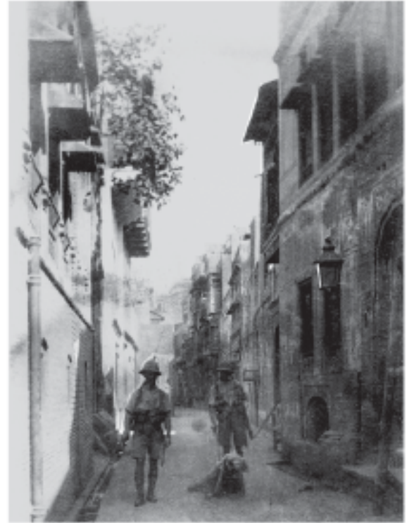
Fig. 3 – General Dyer’s ‘crawling orders’ being administered by British soldiers, Amritsar, Punjab, 1919.

In his famous book Hind Swaraj (1909) Mahatma Gandhi declared that British rule was established in India with the cooperation of