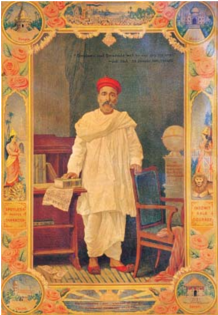
Fig. 11 – Bal Gangadhar Tilak, an early-twentieth-century print. Notice how Tilak is surrounded by symbols of unity. The sacred institutions of different faiths (temple, church, masjid) frame the central figure.

Nationalism spreads when people begin to believe that they are all part of the same nation, when they discover some unity that binds them together. But how did the nation become a reality in the minds of people? How did people belonging to different communities, regions or language groups develop a sense of collective belonging?