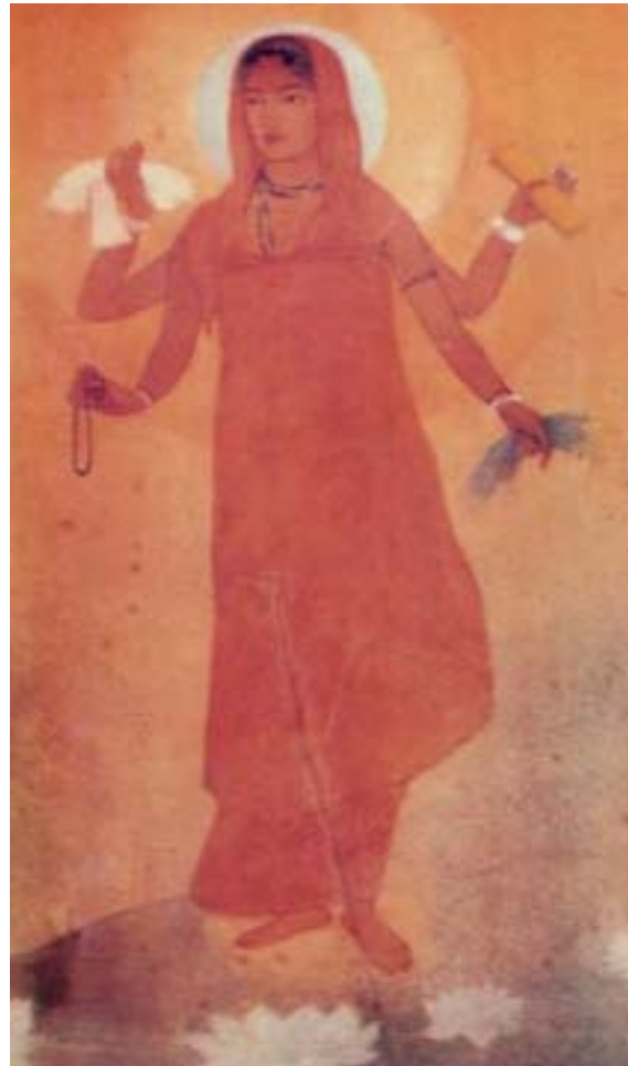
Fig. 12 – Bharat Mata, Abanindranath Tagore, 1905.

Ideas of nationalism also developed through a movement to revive Indian folklore. In late-nineteenth-century India, nationalists began recording folk tales sung by bards and they toured villages to gather folk songs and legends. These tales, they believed, gave a true picture of traditional culture that had been corrupted and damaged by outside forces. It was essential to preserve this folk tradition in order to discover one’s national identity and restore a sense of pride in one’s past. In Bengal, Rabindranath Tagore himself began collecting ballads, nursery rhymes and myths, and led the movement for folk