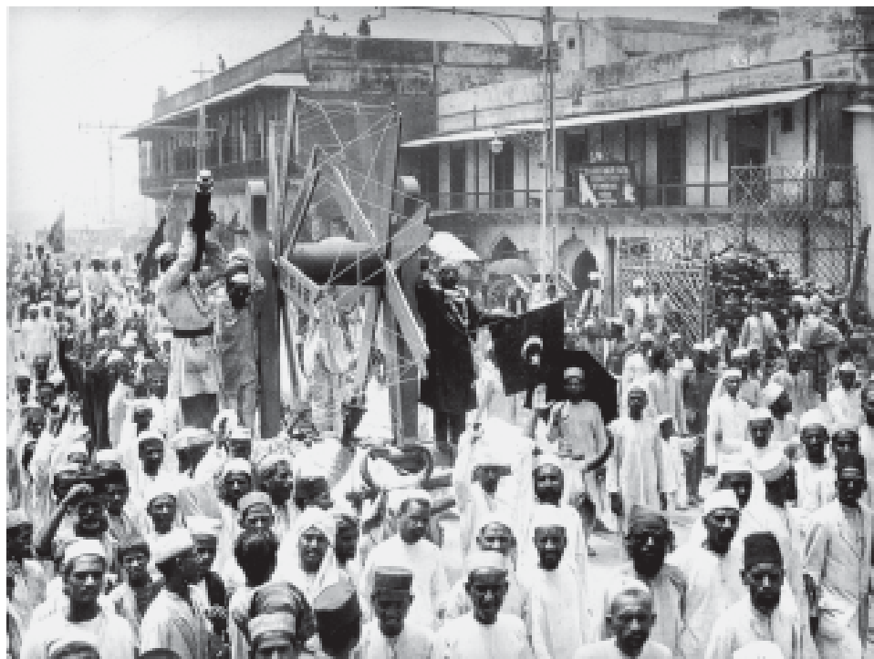
Fig. 4 – The boycott of foreign cloth, July 1922. Foreign cloth was seen as the symbol of Western economic and cultural domination.

Boycott – The refusal to deal and associate with people, or participate in activities, or buy and use things; usually a form of protest