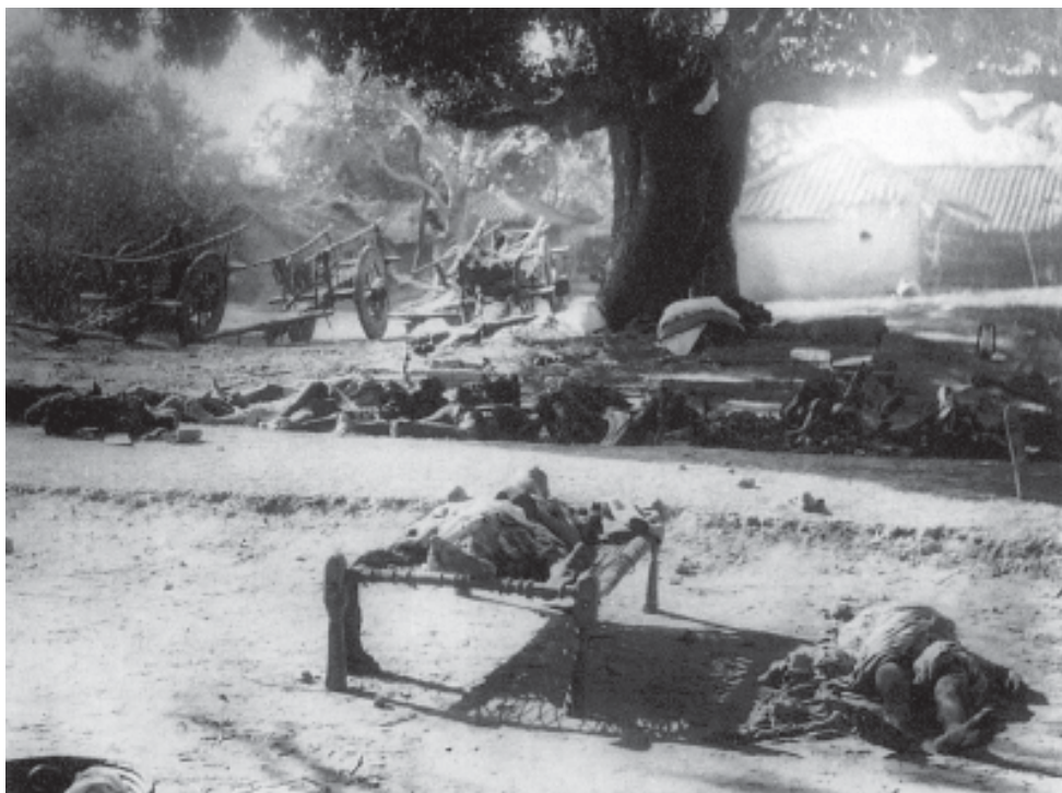
Fig. 5 – Chauri Chaura, 1922.

The visions of these movements were not defined by the Congress programme. They interpreted the term swaraj in their own ways, imagining it to be a time when all suffering and all troubles would be over. Yet, when the tribals chanted Gandhiji's name and raised slogans demanding 'Swatantra Bharat', they were also emotionally relating to an all-India agitation. When they acted in the name of Mahatma Gandhi, or linked their movement to that of the Congress, they were identifying with a movement which went beyond the limits of their immediate locality.