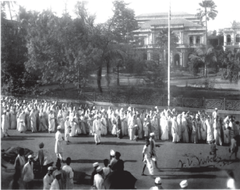
Fig. 9 – Women join nationalist processions. During the national movement, many women, for the first time in their lives, moved out of their homes on to a public arena. Amongst the marchers you can see many old women, and mothers with children in their arms.

picketed foreign cloth and liquor shops. Many went to jail. In urban areas these women were from high-caste families; in rural areas they came from rich peasant households. Moved by Gandhiji's call, they began to see service to the nation as a sacred duty of women. Yet, this increased public role did not necessarily mean any radical change in the way the position of women was visualised. Gandhiji was convinced that it was the duty of women to look after home and hearth, be good mothers and good wives. And for a long time the Congress was reluctant to allow women to hold any position of authority within the organisation. It was keen only on their symbolic presence.