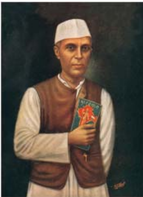
Fig. 13 – Jawaharlal Nehru, a popular print.

Notice that the mother figure here is shown as dispensing learning, food and clothing. The mala in one hand emphasises her ascetic quality. Abanindranath Tagore, like Ravi Varma before him, tried to develop a style of painting that could be seen as truly Indian.