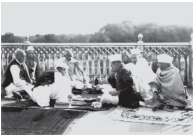
Fig. 6 – Meeting of Congress leaders at Allahabad, 1931. Apart from Mahatma Gandhi, you can see Sardar Vallabhbhai Patel (extreme left), Jawaharlal Nehru (extreme right) and Subhas Chandra Bose (fifth from right).

When the Simon Commission arrived in India in 1928, it was greeted with the slogan 'Go back Simon'. All parties, including the Congress and the Muslim League, participated in the demonstrations. In an effort to win them over, the viceroy, Lord Irwin, announced in October 1929, a vague offer of 'dominion status' for India in an unspecified future, and a Round Table Conference to discuss a future constitution. This did not satisfy the Congress leaders. The radicals within the Congress, led by