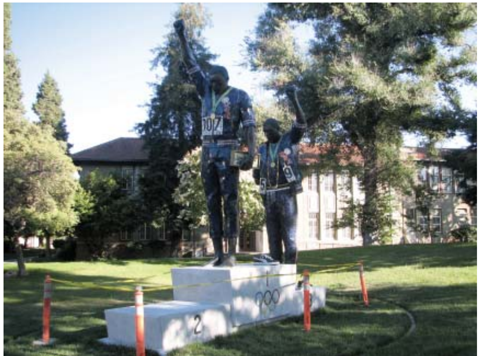
In 2005, the San Jose State University installed a 20-foot high sculpture representing the protest by Tommie Smith and John Carlos. A photograph of the original medal ceremony in 1968 is on the top.

Do you think that Carlos and Smith should have raised an internal matter of American society in an international forum? Would you say that what they did was political? Why do you think Peter Norman, who was neither Black nor American, joined in the gesture of protest? If you were in Norman's place what would you do?