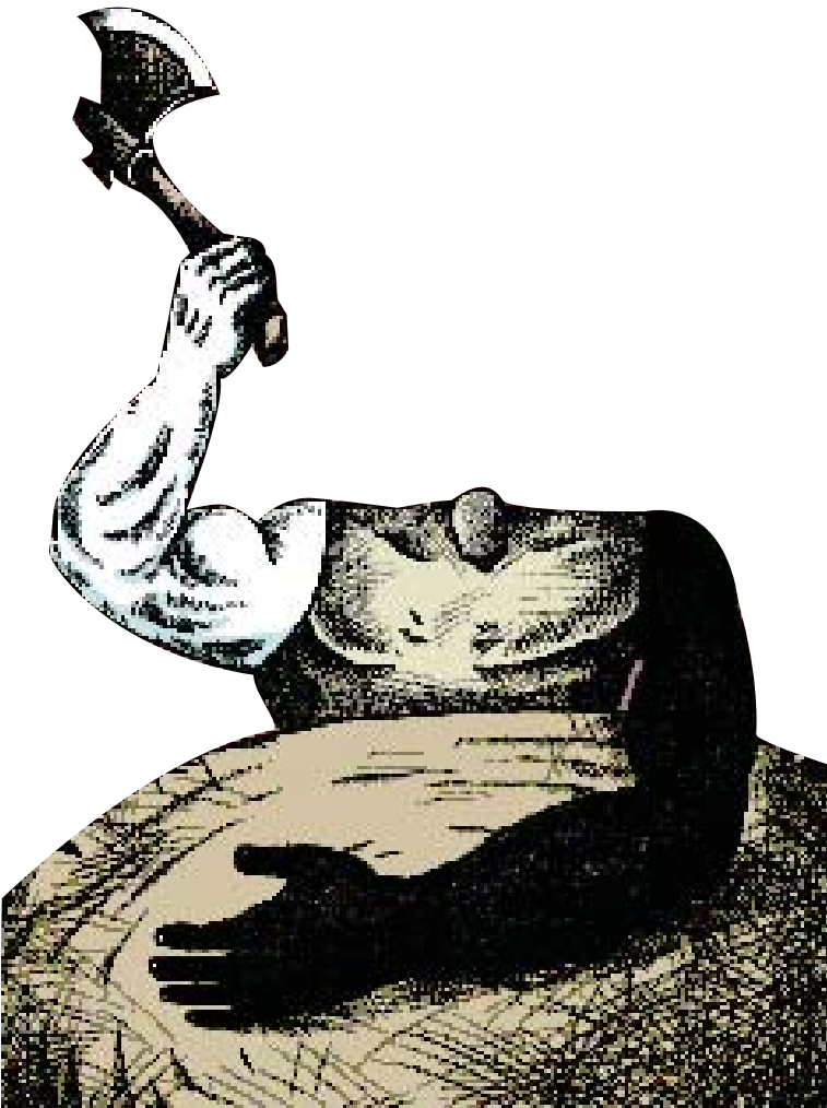
© Ares - Cagle Cartoons Inc.

It is fairly common for people belonging to the same religion to feel that they do not belong to the same community, because their caste or sect is very different. It is also possible for people from different religions to have the same caste and feel close to each other. Rich and poor persons from the same family often do not keep close relations with each other for they feel they are very different. Thus, we all have more than one identity and can belong to more than one social group. We have different identities in different contexts.