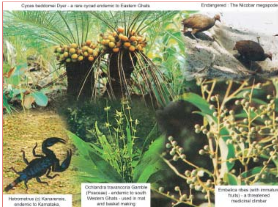
Fig. 2.2: A few extinct, rare and endangered species