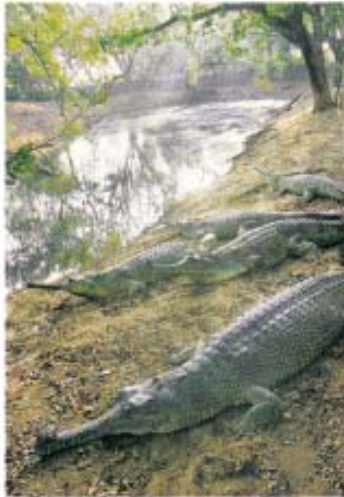
CRITICALLY ENDANGERED: Captive gharial at the Madras

W ISPY tendrils of mist rise delicately from the water surface, tinged gold by the dawn. Your breath hangs as little clouds of vapour as you gaze upon the Gwra River on a cold winter morning. A trio of hollow clapping sounds from the other side of the river, half a kilometre away tells you that an adult male gharial is advertising his presence. It is the height of the breeding season. The place seems trapped in a time in early history when man was still clad in animal skins. It is only as the sun rises higher and burns the mist off the water that the world comes into focus with appalling clarity. The five-km stretch of the Gwra River in Katerniaghat Wildlife Sanctuary is one of the only three wild breeding sites left in the world for the most ancient of all the