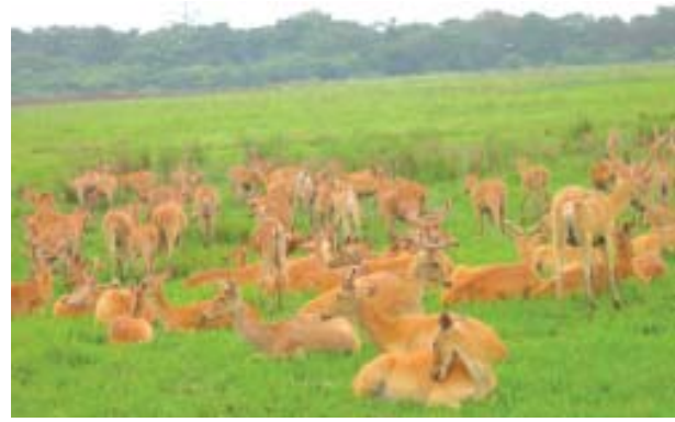
Fig. 2.4: Rhino and deer in Kaziranga National Park

horned rhinoceros, the Kashmir stag or hangul , three types of crocodiles – fresh water crocodile, saltwater crocodile and the Gharial , the Asiatic lion, and others. Most recently, the Indian elephant, black buck ( chinkara ), the great Indian bustard ( godawan ) and the snow leopard, etc. have been given full or partial legal protection against hunting and trade throughout India.