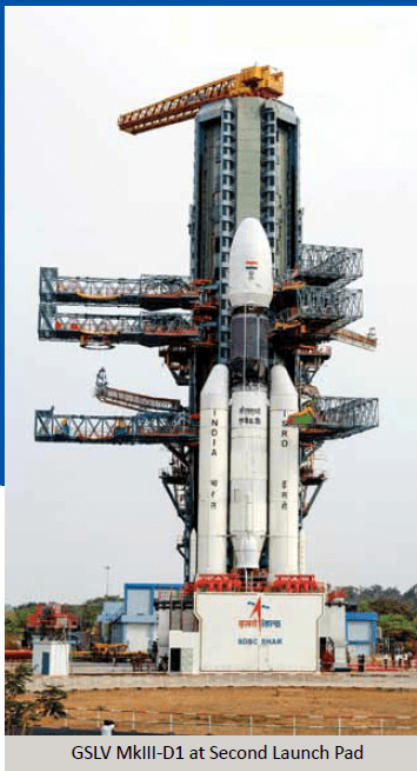
GSLV MkIII-D1 at Second Launch Pad