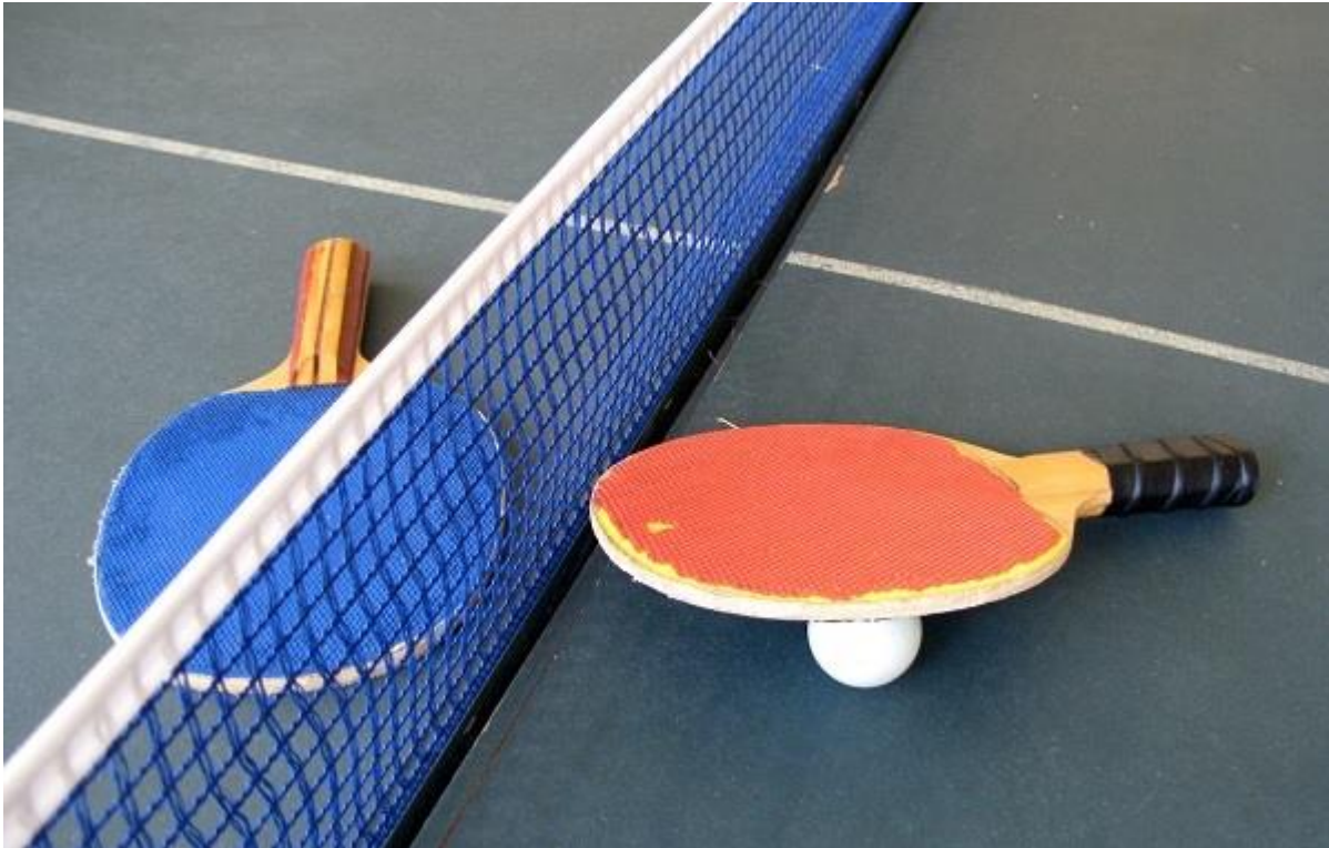
Table tennis, also called ping pong, is a sport that originated in the Victorian period in England. High-class people used to play table tennis after dinner. It was initially played by stacking books at the center of a table and hitting a golf ball with thick books. Table tennis needs a lot of attention and speed.

Professional table tennis is played on a hard table which is divided by a net. Players stand opposite to each other, and hit a lightweight ball with a small round bat across the table. Spinning the ball makes the chances of hitting the ball a lot less. So, players tend to spin the ball before serving it to the opponent.