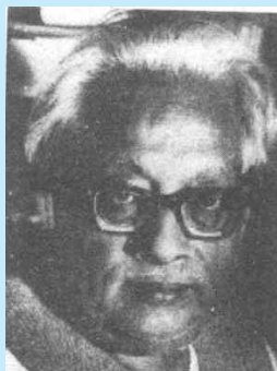
Satyendranath Bose (1894-1974)

Satyendranath Bose, born in Calcutta in 1894, is among the great Indian physicists who made a fundamental contribution to the advance of science in the twentieth century. An outstanding student throughout, Bose started his career in 1916 as a lecturer in physics in Calcutta University; five years later he joined Dacca University. Here in 1924, in a brilliant flash of insight, Bose gave a new derivation of Planck's law, treating radiation as a gas of photons and employing new statistical methods of counting of photon states. He wrote a short paper on the subject and sent it to Einstein who immediately recognised its great significance, translated it in German and forwarded it for publication. Einstein then applied the same method to a